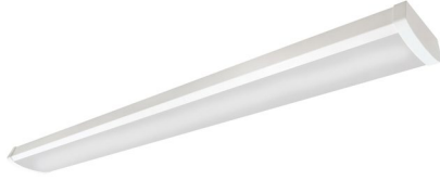
TRC 4 ft

The TRC Selectable Surface Wraparound Contractor Series Gen 1 features a clean low-profile wraparound design with decorative end caps and a frosted lens. Unobtrusive and efficient, this luminaire provides widespread, uniform illumination that is ideal for many applications including corridors, hallways, kitchens, etc. This is available in 4 ft with selectable lumen packages between 3,950 to 5,600 lumens and selectable color temperatures 3500K, 4000K and 5000K.